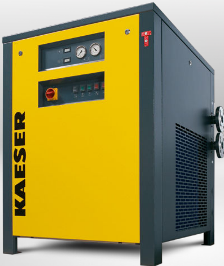
Standard version THP 40-50