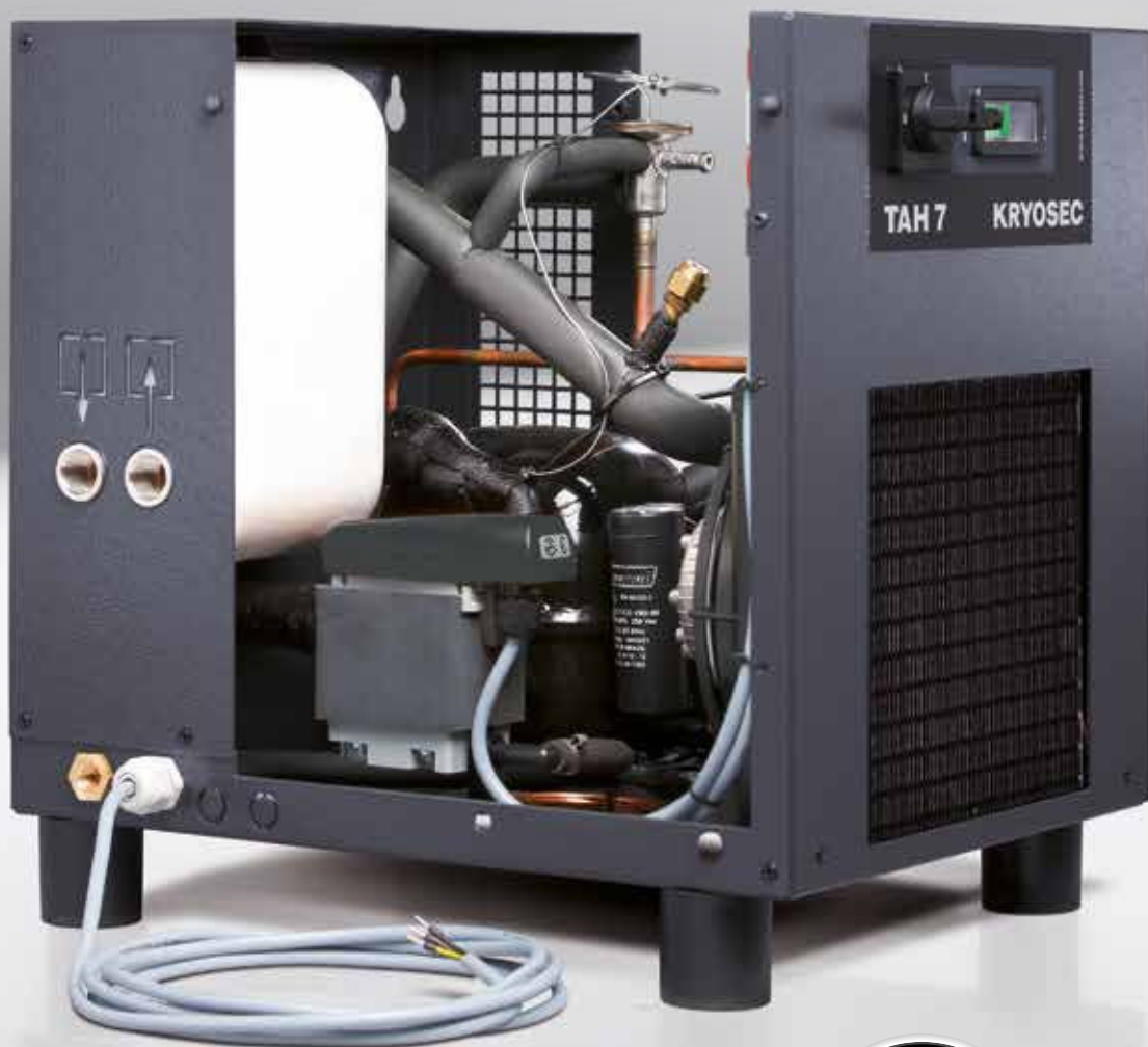
Image: TAH 7