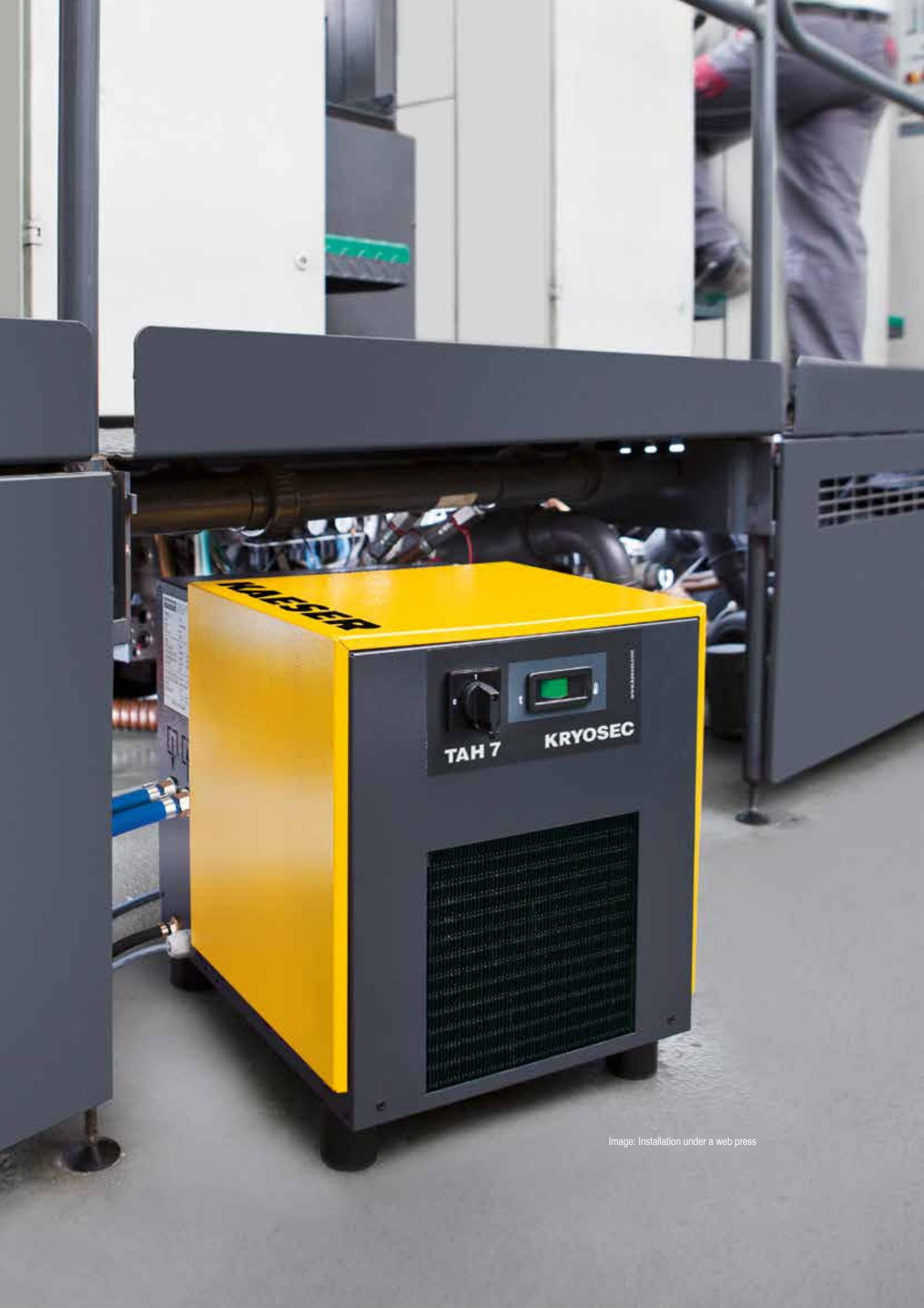
Image: Installation under a web press