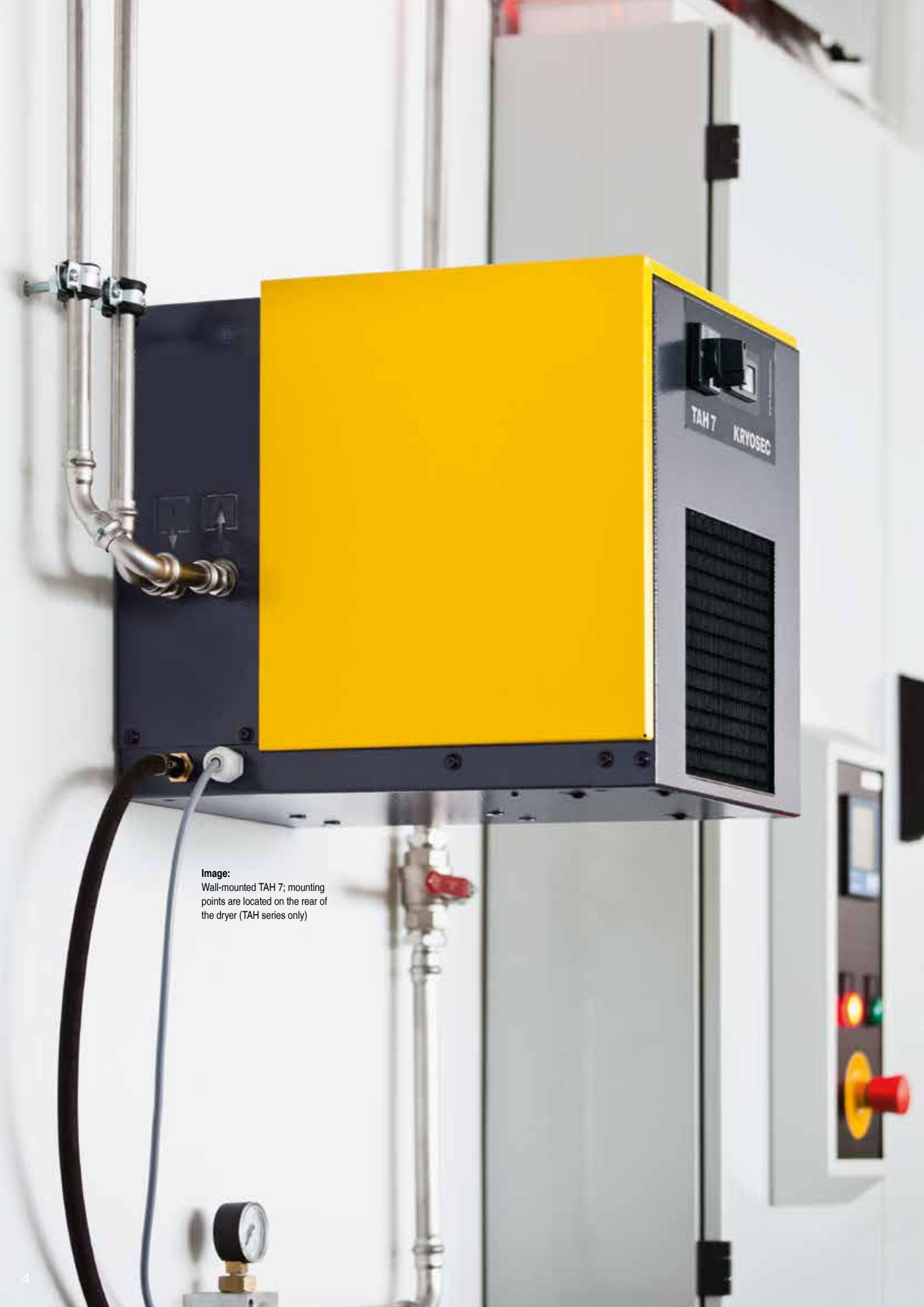
Image: Wall-mounted TAH 7; mounting points are located on the rear of the dryer (TAH series only)