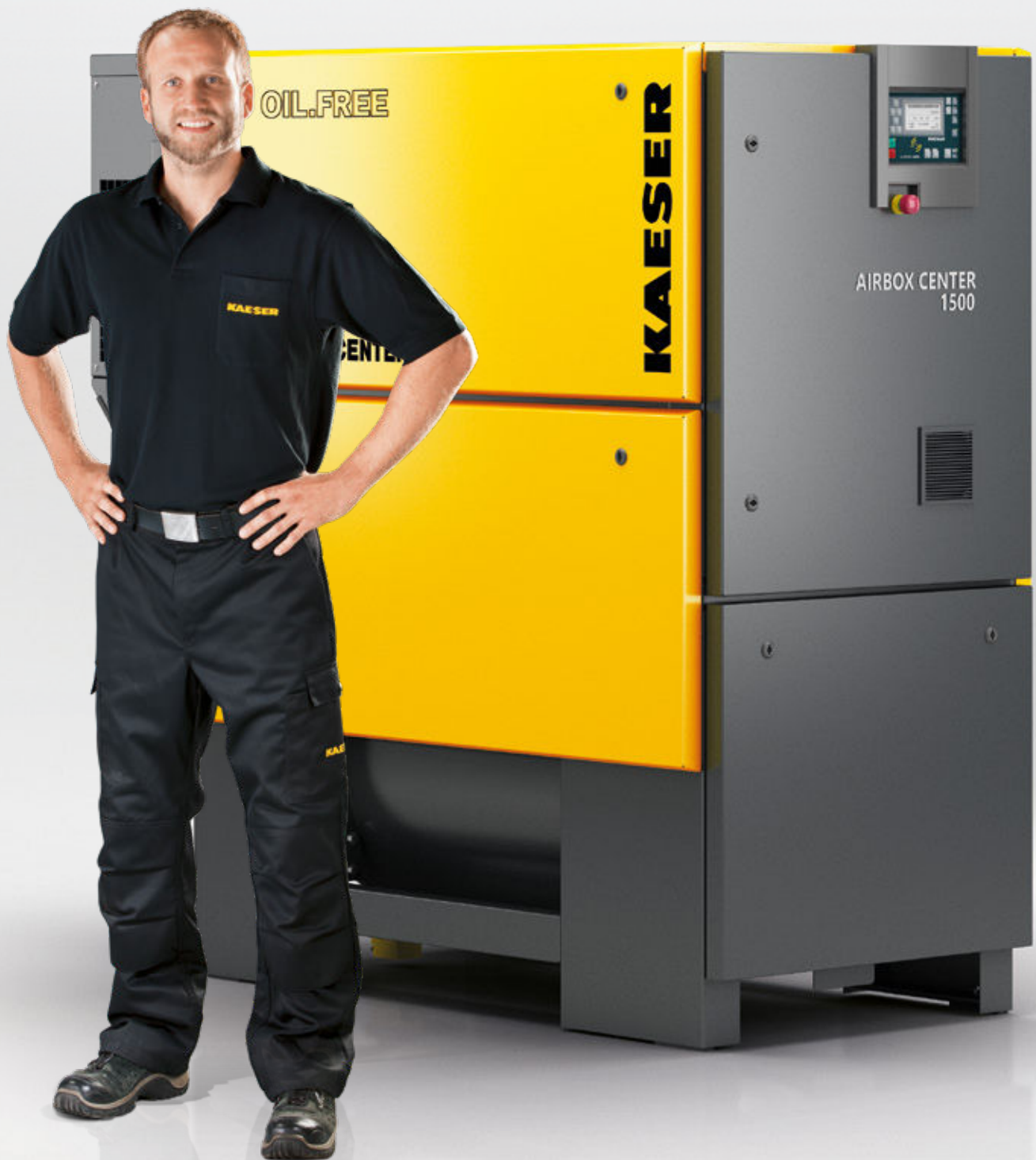
Image: AIRBOX CENTER 1500