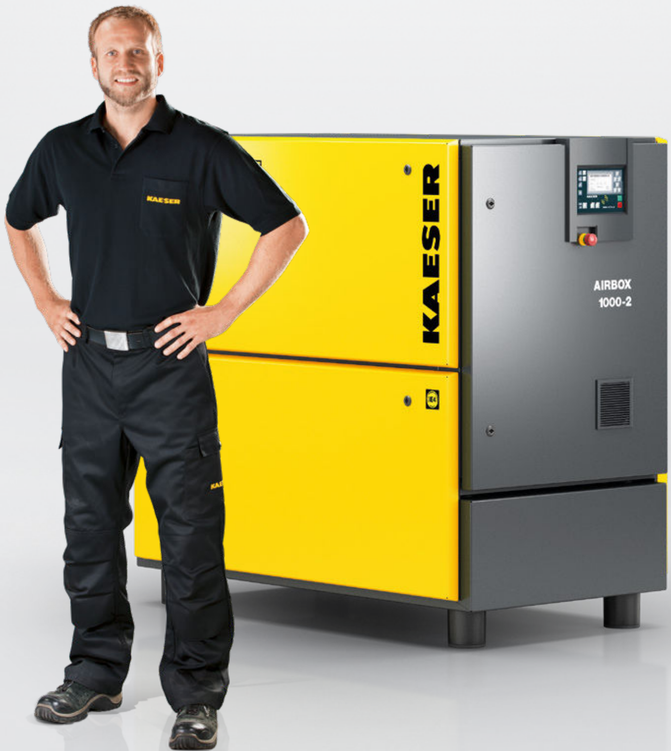
Image: AIRBOX 1000-2