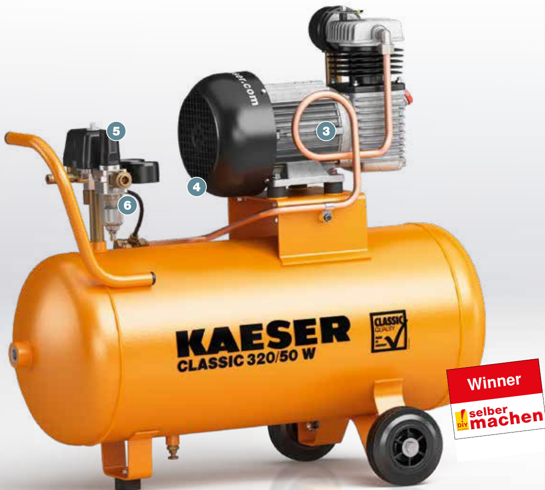
Image: CLASSIC 320/50 W