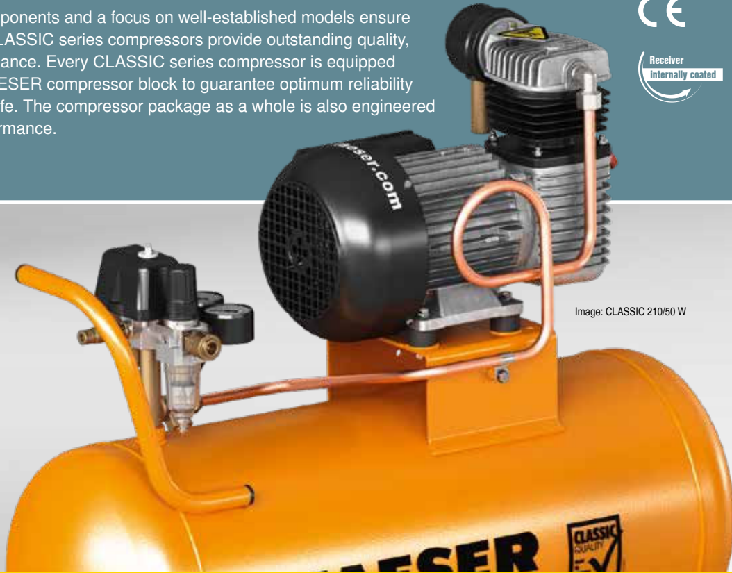
Image: CLASSIC 210/50 W