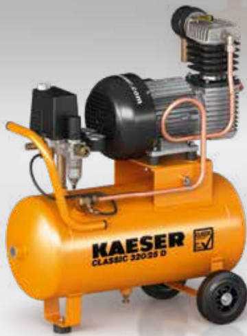
Image: CLASSIC 320/25 D