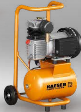
Image: CLASSIC mini 210/10 W