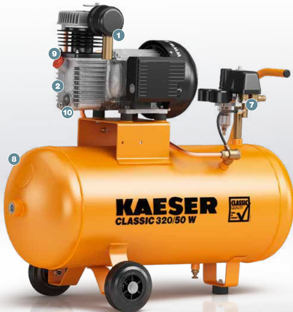
Image: CLASSIC 320/50 W