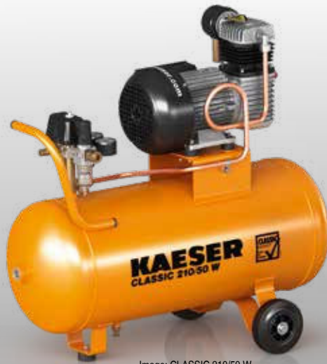
Image: CLASSIC 210/50 W