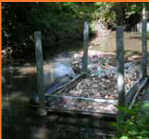
ENHANCER Series (With Basket)